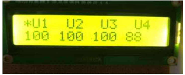
Figure 4. Value of Dustbins on LCD