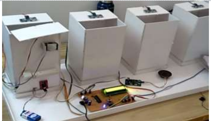
Figure 2.Smart Dustbin Management System

ISSN: 2277-9655 Impact Factor: 5.164 CODEN: IJESS7