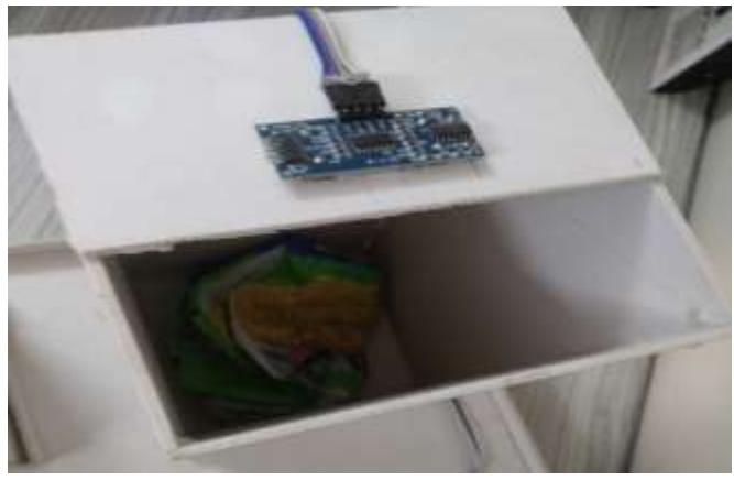
Figure 3. Garbage in South (U4) Dustbin

When there is some waste in any of the dustbin shown in figure 3 the value on the LCD changes with respect to that dustbin and when this system is connected to the network via Wi-Fi module the it sends the data to the app which shows the same value that can be checked by the admin or by an individual employee assigned to that particular dustbin shown in figure 4 and figure 5.